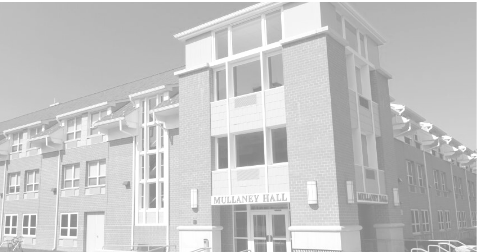
Photo above is Mullaney Hall.

Your room/apartment/suite must be shared equally with all residents assigned to that specific room/apartment/suite. This includes furniture, its configuration and how the space is shared in the room. The Office of Residential Life will work with student to ensure that all students have an equal and appropriate amount of space in their room/apartment/suite. The Office of Residential Life would prefer that students make this determination on their own, however, if necessary, each student will be assigned an equal portion or “half” of the room to be utilized.