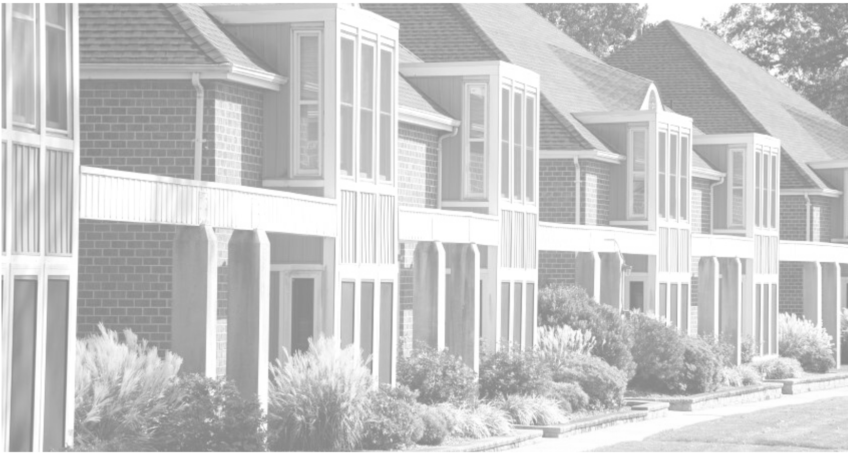
Photo above is the Great Lawn Apartments.