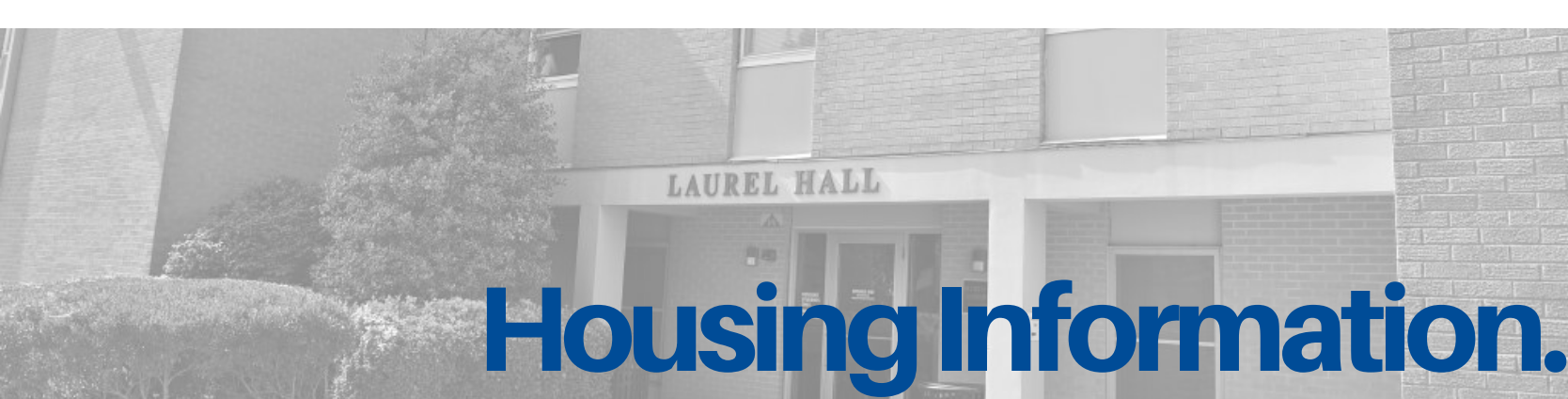
Photo above is Laurel Hall..