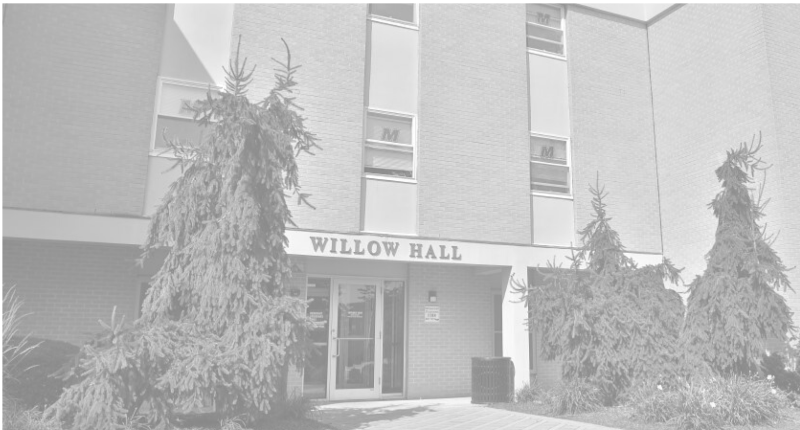
Photo above is Willow Hall..

Students using needles for diabetic or other legitimate medical reasons are responsible for disposing of these needles properly. Students are responsible for providing their own Sharps containers to store their needles. Used needles in an appropriate sharps container can be brought to the Health Center where they will be disposed of properly in accordance with OSHA and EPA guidelines. Used needles must be stored in a puncture resistant container such as a Sharps container (preferred) or an empty detergent bottle with the lid taped securely that is clearly labeled as a Sharps disposal container. The storage or disposal of needles in any other type of container is unacceptable. Further, needles may never be disposed of in room, common area or building trash room, waste or recycling receptacles. Students who fail to adhere to this policy will be subject to disciplinary action and the possibility of the termination of their housing contract